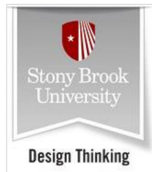
A screen shot of a badge offered by Stony Brook University in Design Thinking ( http://www.stonybrook.edu/commcms/spd/badges/catalog.php ).

A number of SUNY campuses award badges for student participation in extra-curricular activities or to recognize meritorious achievement. The Task Force recommends that campuses be careful to differentiate between badges that represent completion of learning standards (the focus of this report) and those that reflect service.